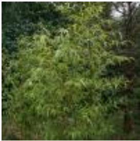
Other - whole plant - Late Spring