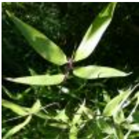
Branch - Late Summer