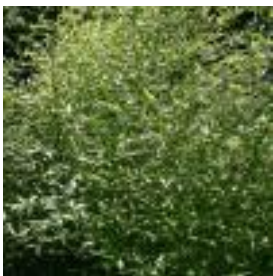
Other - whole plant